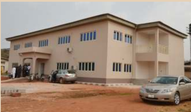
The NLNG-built and equipped research laboratory at University of Nigeria, Nsukka