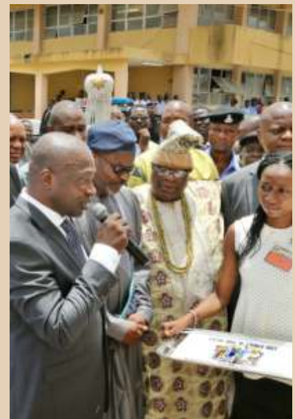
Dignitaries undertake a tour of the facilities at NLNG/University of Ibadan Laboratory during the commissioning

Needless to say, the organisation feels considerably fulfilled and hopes to see these