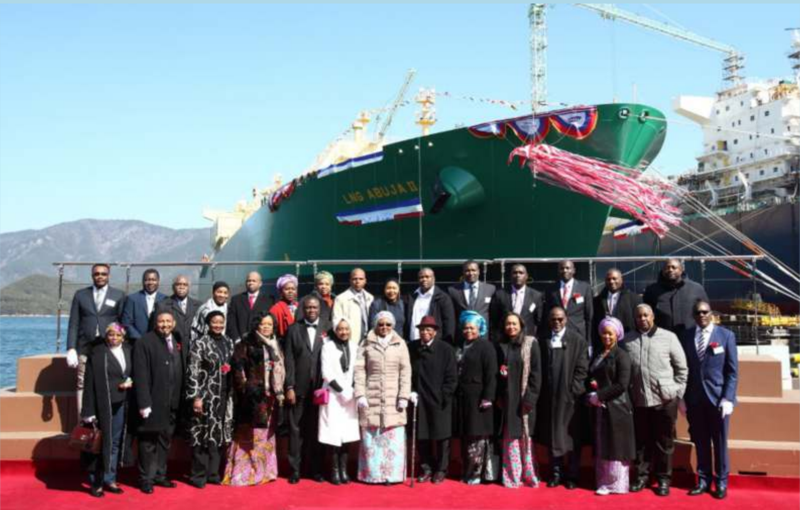
At the commissioning: NLNG's delegation to South Korea including President Buhari's wife, Aisha Buhari, and members of NLNG and BGT's board and management teams with some Nigerian diplomatic community members. Behind them is the new ship, LNG Abuja II

The wife of Nigeria's President, Mrs Aisha Buhari, recently named a new ship, LNG Abuja II, owned by Bonny Gas Transport (BGT), a subsidiary of Nigeria LNG Limited (NLNG), in her capacity as the vessel's Godmother.