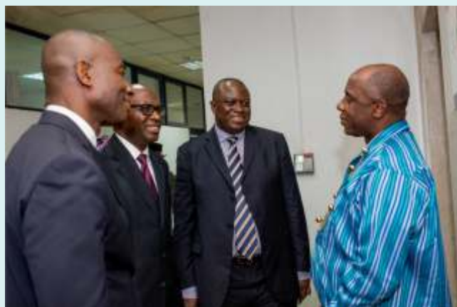
NLNG team in a chat with Minister of Transport, Chibuike Amaechi