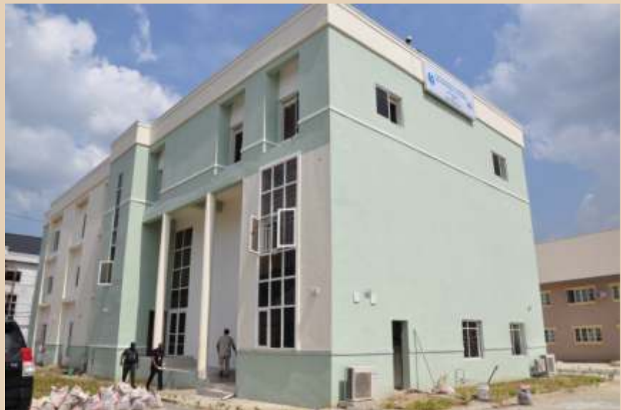
NLNG Centre for Gas, Refining and Petrochemical Engineering at University of Port Harcourt

University of Port Harcourt (UniPort), based in the heart of Nigeria's oil and gas province, decided to build a centre of excellence for capacity development in this industry that would house the only modular refinery within an academic institution in Sub-Saharan Africa. This project is housed in the Institute of Petroleum Studies industrial park at UniPort and hopes to benefit from collaborative opportunities at the Institute. The centre houses a world-class amphitheatre, a