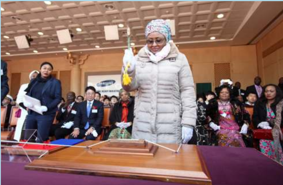
Aisha Buhari, Nigeria's First Lady, performing her duty as LNG Abuja II's Godmother and Sponsor Lady