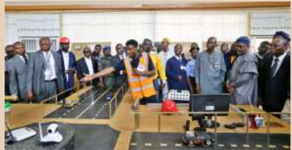
A scene from the commissioning at University of Ibadan, coordinated by some of the engineering students who also took part in building the laboratory

and a hard-won victory for all parties involved.