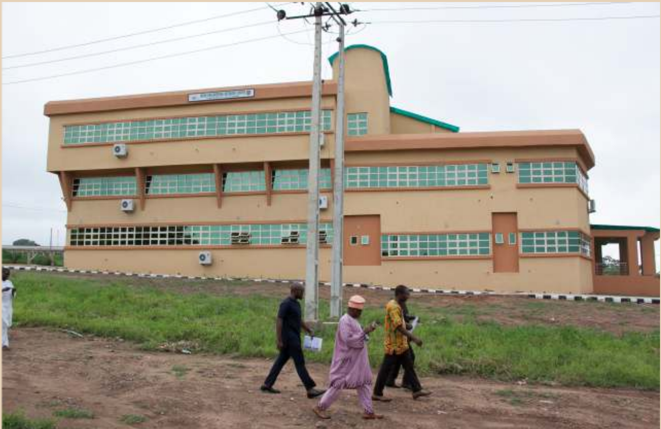
NLNG Engineering Research Centre at University of Ilorin