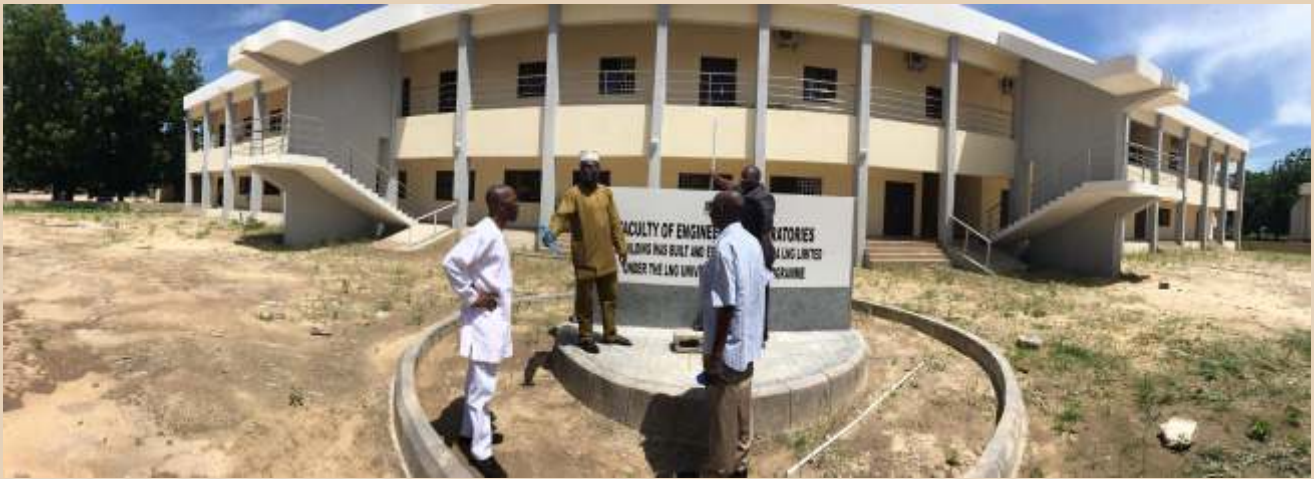
The NLNG-built Faculty of Engineering Laboratories, University of Maiduguri