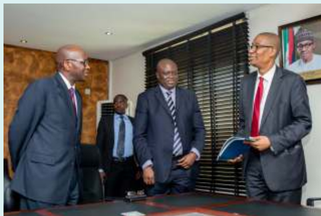
NLNG Team with Minister of Industry, Trade and Investment, Dr. Okey Enelamah, at the Minister's office