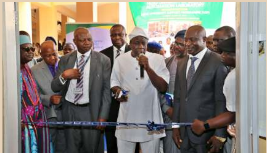
The commissioning of NLNG/UI Engineering Laboratory Complex took place at University of Ibadan on March 29, 2016

utilized for the execution of the project, choosing, quite uniquely, to devote the bulk of its funds to equipping each laboratory with as much state-of-the-art equipment as possible. Commissioned on that fateful Saturday morning in November, the NLNG-Multi-User laboratory features six distinct laboratories: a soil-testing laboratory, an environmental laboratory, a mechatronics laboratory, a materials characterization laboratory, a materials-testing laboratory and an ICT laboratory/video conferencing centre.