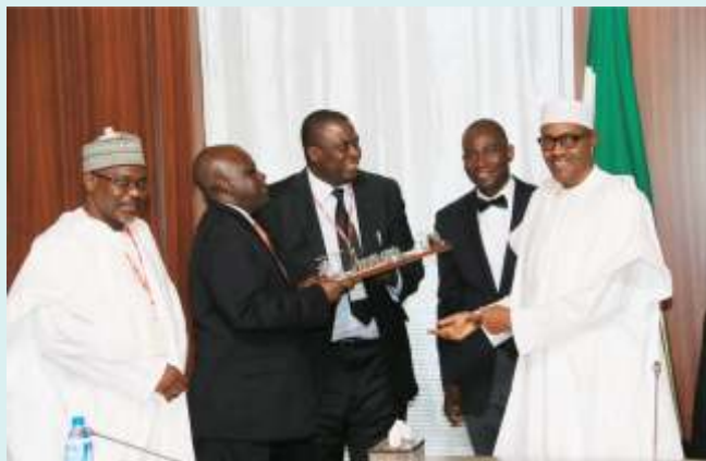
Some members of NLNG's Board and Executive Management paid a courtesy call on the President of the Federal Republic, Muhammadu Buhari, GCFR.