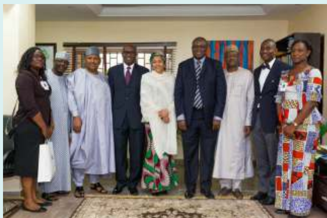
NLNG team with Minister of Environment, Amina Mohammed, at the Ministry of Environment