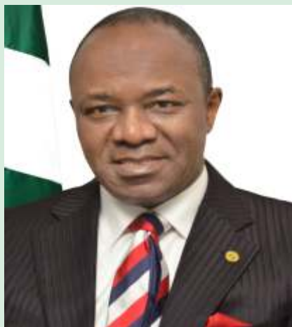
Dr Emmanuel Ibe Kachikwu Minister of State for Petroleum

The Minister of State for Petroleum, Dr Emmanuel Ibe Kachikwu, in his keynote address at the recently held National Association of Energy Correspondents (NAEC) Annual Conference assured that the Federal Government was in solidarity with NLNG on ensuring that Nigeria's contractual agreements are honoured. He added that reforms in the industry can't be done on the altar of investments, instead collaboration, creativity and reality should be applied.